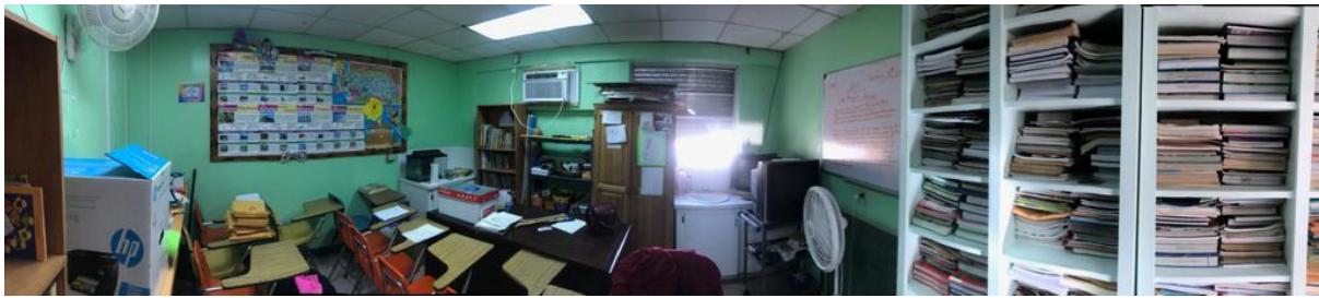
Children's Ward classroom before renovations.

With the successful completion of its first joint project with the hospital, the 10-year-old Paradise Children's Foundation, whose aim is to uplift Bahamian children, says its work has only just begun.